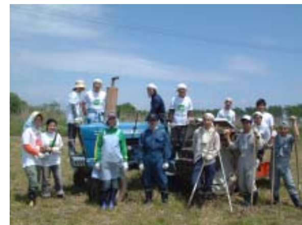
Agricultural internship in Ogata Village, Akita Prefecture

Plans to develop HR business in agriculture and IT fields, two new job areas for the young and seniors